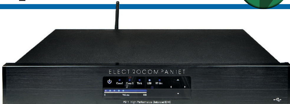
ABOVE: Horizontal arrows on the display toggle between digital inputs, vertical arrows control volume up/down

Via S/PDIF the PD-1 has a distinctive sonic footprint that, if memory serves, bears a strong family resemblance to the previous ECD1. People who fall in love with the Electro – and there will be many – will be seduced by the unfailingly