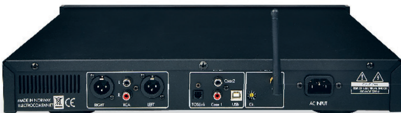
ABOVE: Both balanced and unbalanced digital outputs are provided but there is no balanced digital input. Wireless input connects to optional EMS 1 music streamer